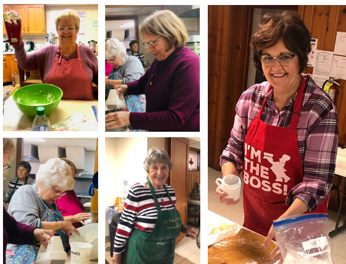
Circle Six ladies once again having fun making pumpkin rolls!