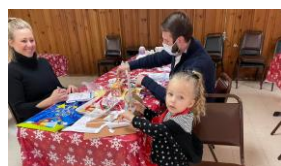
Caring for Others