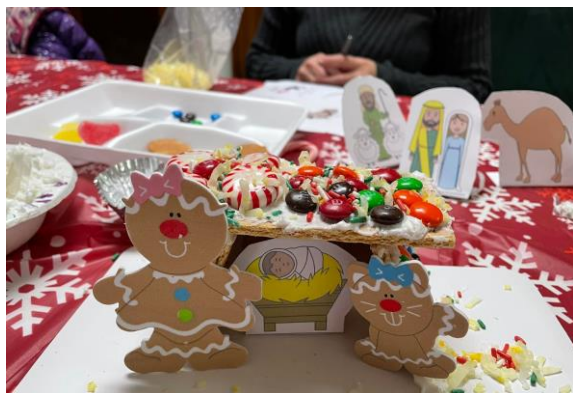
Caring for Us