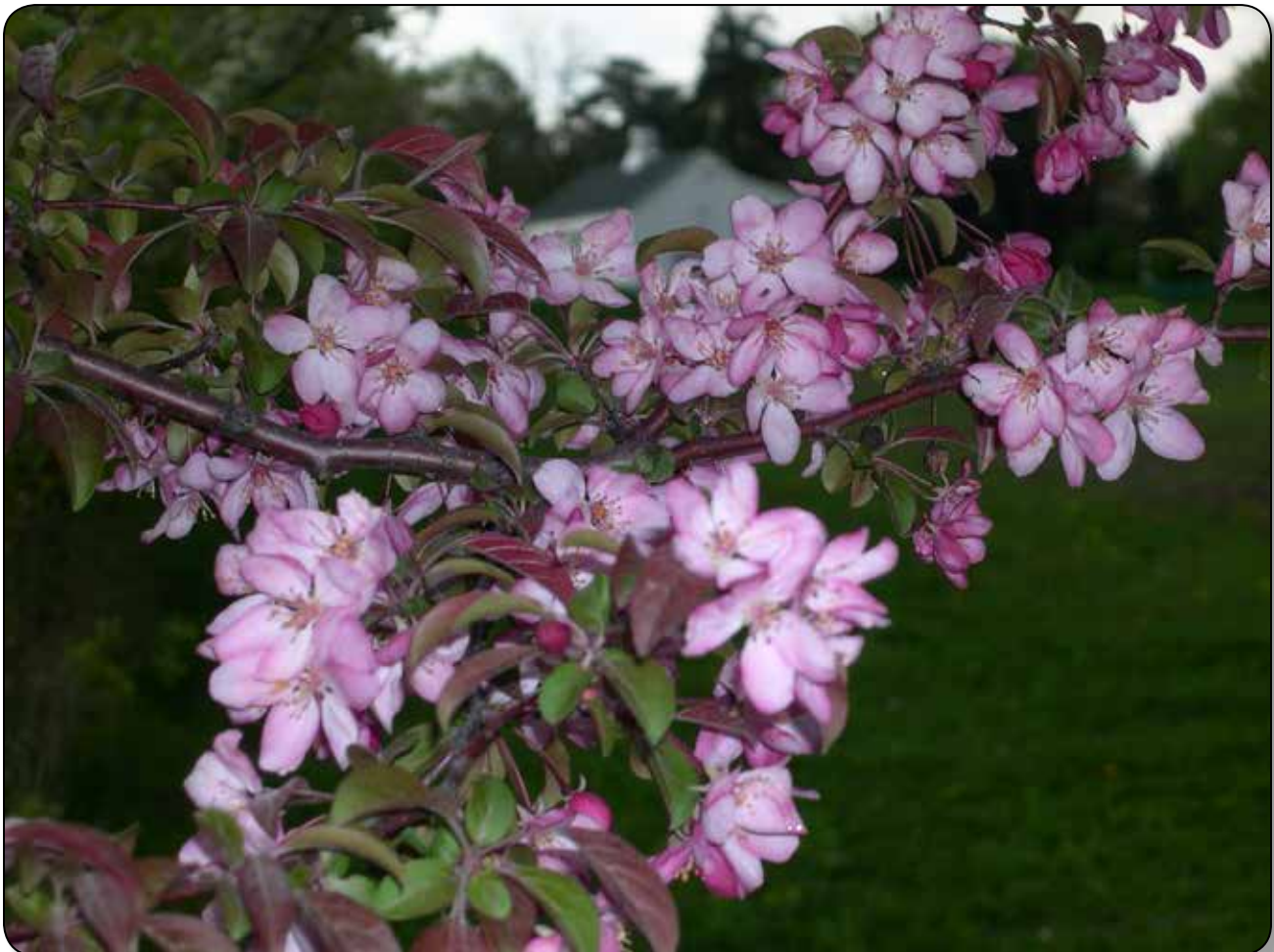
Wild crabapple ( Malus coronaria ) in bloom on North Ridge, Sheffield Village (May 2004).