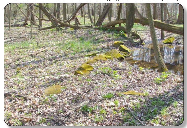
Foundation stones of Sheffield Congregational Church (2012)

With no further services, the dilapidated old church was torn down in the 1930s, but some pieces of the foundation can still be seen in the French Creek Reservation of the Lorain County Metro Parks, across East River Road from the Burrell Homestead.