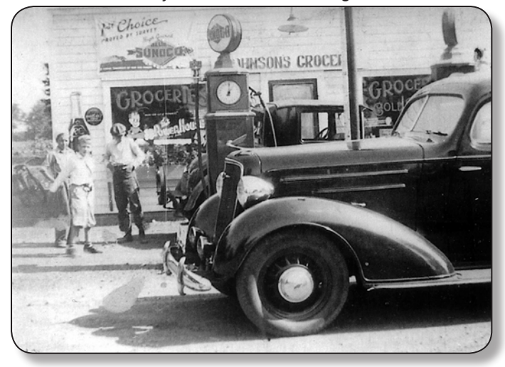
In the summer ice cream cones were sold at a drive-up window

In the 1930s the Johnsons sold Sunoco gasoline; later they handled the Fleet Wing brand