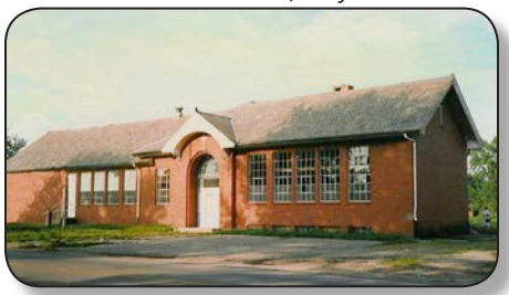
Saint Teresa School's attendance declined when children began attending Saint Thomas School and the decision to close the school came in 1967. After sitting idle for two decades, Saint Teresa School was razed to make way for a parking lot.