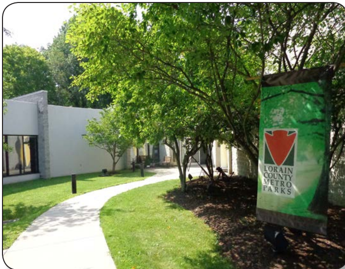
Entrance to French Creek Nature & Arts Center in 2014

areas, reservable classrooms, and a non-lending nature library. The center also boasted a large gallery for hosting temporary exhibits.