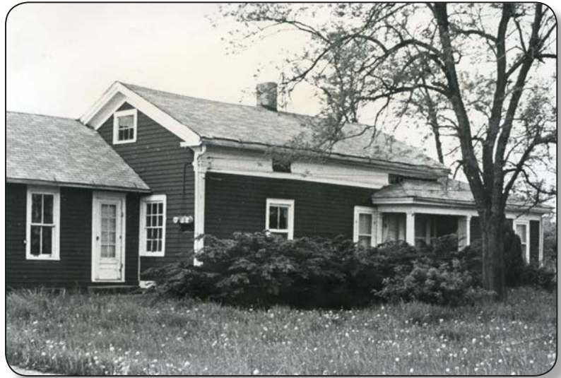
James Day House in 1975

In 1987, Lorain County Metro Parks embarked on a $6,000,000 development plan for the French Creek Reservation, the capstone feature being the French Creek Nature Center. The Nature Center, staffed by park personnel and volunteers, was designed with an entrance off Colorado Avenue (State Route 611) and scheduled to be open daily. Originally the building emphasized the natural environment of the French Creek valley with exhibits and program rooms, bird and wildlife observation areas, reservable classrooms, and a non-lending nature library. The center also boasted a large gallery for hosting temporary exhibits.