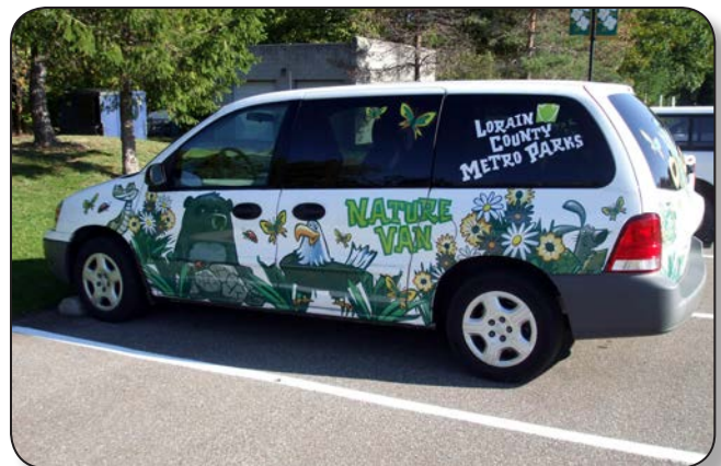
Nature Van at French Creek Nature & Arts Center

areas, reservable classrooms, and a non-lending nature library. The center also boasted a large gallery for hosting temporary exhibits.