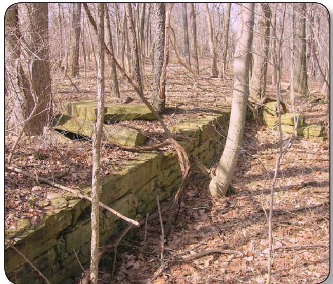
Sandstone foundation of District No. 1 School (2012)

The Sheffield District No. 1 Schoolhouse on French Creek was located a few hundred feet north of the Congregational Church that was built in 1852. The school was demolished in the 1930s after sitting idle once Brookside School was opened in 1923. The sandstone block walls of the basement and the school well are visible from the trail on the east side of East River Road leading from James Day Park to the Burrell Homestead. The remains of the school are now within the French Creek Reservation of Lorain County Metro Parks.