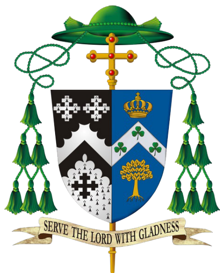
Heraldic Achievement of MOST REVEREND EDWARD C. MALESIC Bishop of Cleveland

In designing the shield—the central element in what is formally called the heraldic achievement—a bishop has an opportunity to depict symbolically various aspects of his own life and heritage, and to highlight particular aspects of Catholic faith and devotion that are important to him. Every coat of arms also includes external elements that identify the rank of the bearer. The formal description of a coat of arms, known as the blazon, uses a technical language, derived from medieval French and English terms, which allows the appearance and position of each element in the achievement to be recorded precisely.