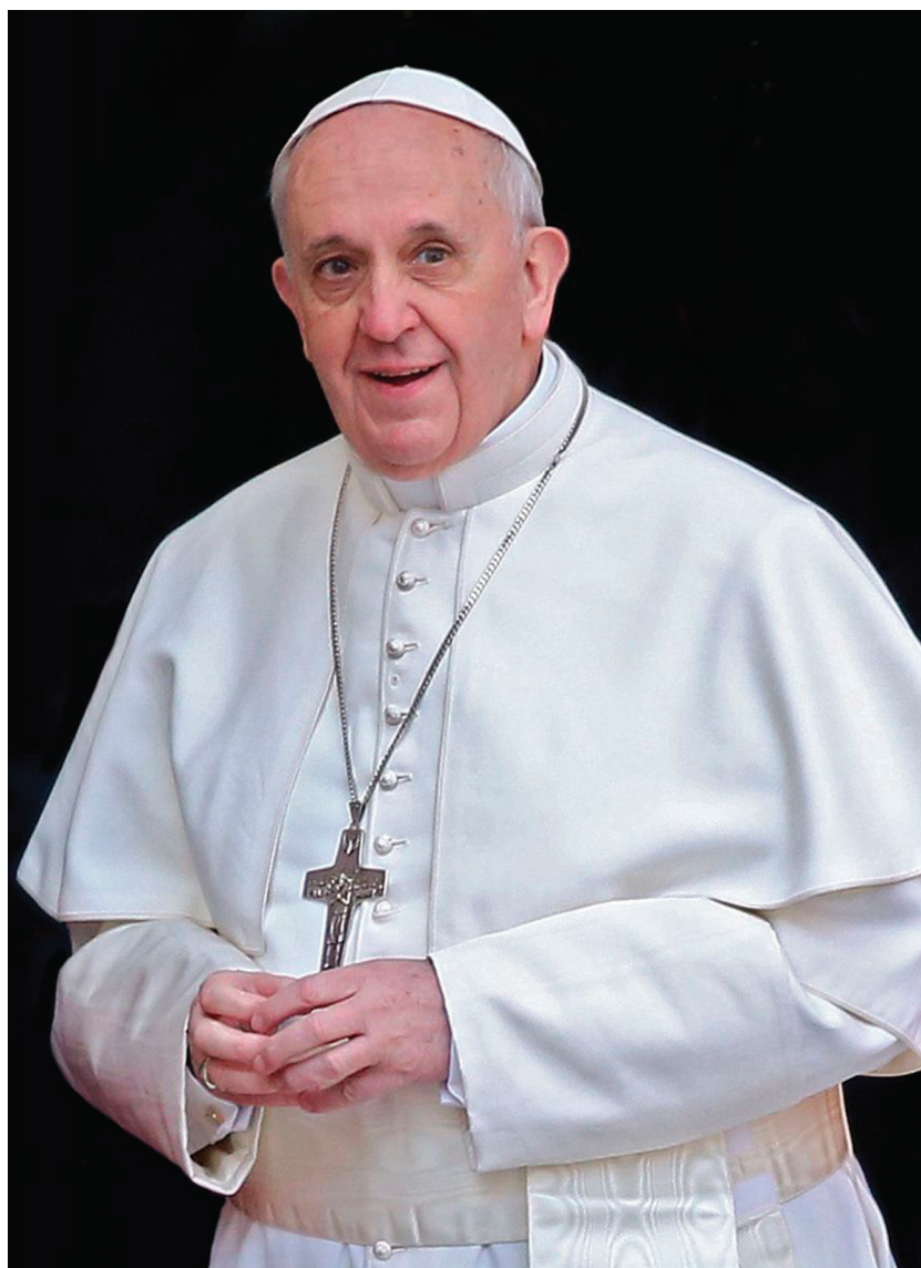
His Holiness POPE FRANCIS