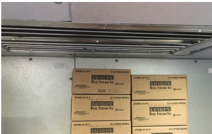
Figure 6 - Ceiling After KE2 Adaptive Control Installed

The icicles that formed while the digital controller was managing the system (as shown in Figure 1) are eliminated, see Figure 6 above. Other surfaces such as the walls, floors, and product, were also free of ice after the KE2 Adaptive Control was installed.