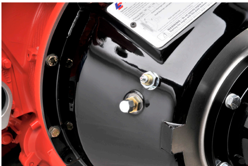
Fluid /Air Actuated, and Self Adjusting

Standard Logan Bell Housing PTO's are available in No. 00 to No.7 size SAE Bells. This application required a Logan LC-314 (No. 01 Size Bell), Clutch for main propulsion and a Logan SAE Direct Drive PTO (1000 series) to drive an auxiliary pump with an SAE C spline off the front of the engine.