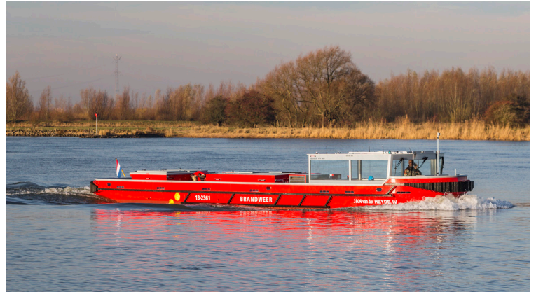
The Jan van der Heyde's low profile design allows it to pass underneath Amsterdam's Canals and bridges to provide overwhelming water flow in fire emergencies