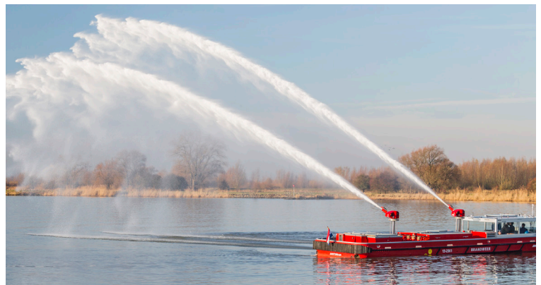
Logan LC-211 Bell Housing PTO clutches supply power to Nijuis brand water pumps, which pump 443,000 gallons / 1680 cubic meters per hour