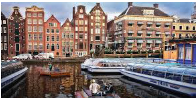
Amsterdam has over 1200 canals and bridges, which span 46 miles / 75 kilometers