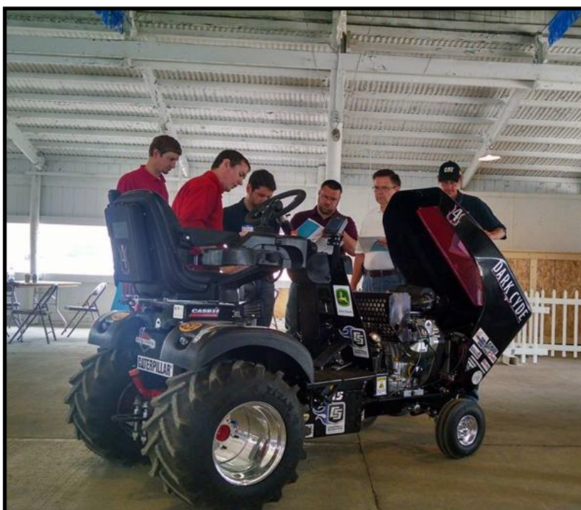
A-Team showing off the main points of Dark CYde during Static Judging.

With the end user in mind all of these innovations combined with the new electronic features such as electric throttle and radar unit provide the capability of ideal performance in un-ideal conditions. The programming allows for many modes of operation including our new Anti-Stall feature. A prime operation for heavy loading situations keeps the engine running at peak horse power while varying ground speed to achieve the maximum tractive effort.