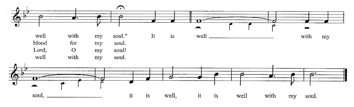
CCLI Song #25376; © Words: Public Domain; Music: Public Domain. For use solely with the SongSelect Terms of Use. All rights reserved. CCLI License #393266