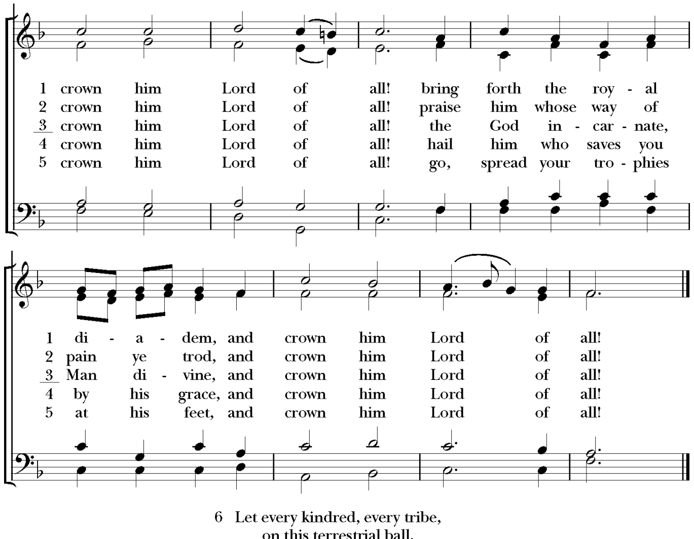
on this terrestrial ball, to him all majesty ascribe, and crown him Lord of all!